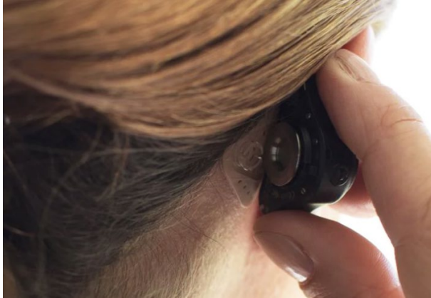
Figure 3 source: https://www.medel.com/en-us/hearing-solutions/bone-conduction-system Accessed Accessed March 13, 2024.