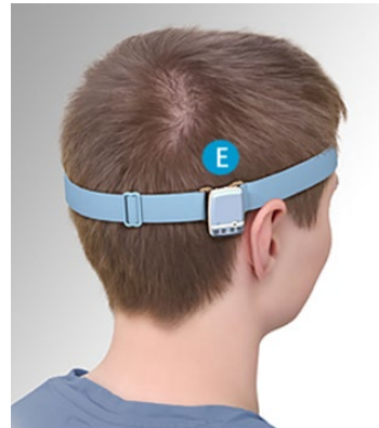
Figure 2. Transcutaneous use of BAHA with Softband